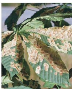
Horse chestnut leaf-miner damage

Over 80 people attended this year's Chilterns Woodland Conference on March 20th near Aylesbury. The theme of the event was tree pests and diseases. Speakers from the Forestry Commission highlighted the current diseases and insects which are attacking trees and new ones which are starting to spread into the UK. The threats from deer and grey squirrels were also covered. New funding available from the Forestry Commission and via the Chilterns LEADER programme to tackle pests and diseases was discussed.